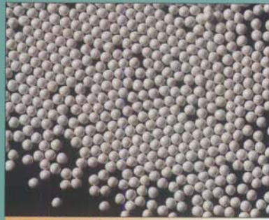
RIMAX 2.0-2.2 mm.