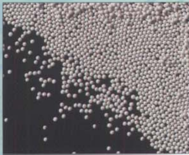
RIMAX 1.0-1.2 mm.