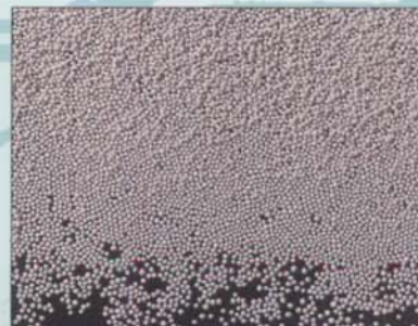
RIMAX 0.6-0.8 mm.