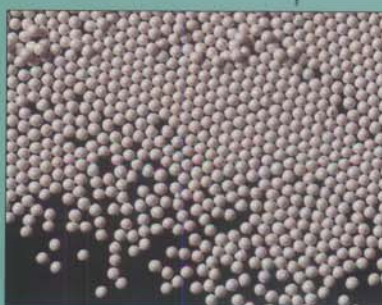
RIMAX 1.6-1.8 mm.