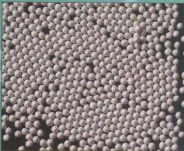
RIMAX 1.8-2.0 mm.